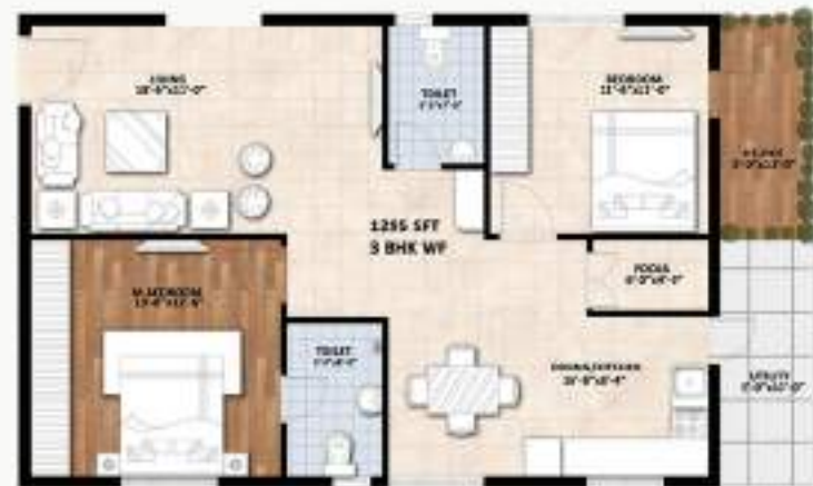
FLAT 13 & 14 CARPET AREA 896.52 SFT BALCONY AREA 59.09 SFT COMMON AREA 339.39 SFT SUPER BUILT AREA 1295 SFT