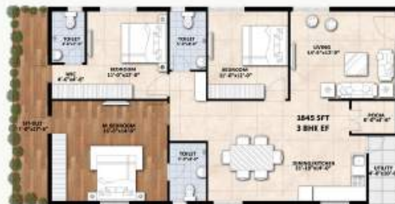
FLAT 17 CARPET AREA 1240.22 SFT BALCONY AREA 137.67 SFT COMMON AREA 467.11 SFT SUPER BUILT AREA 1845 SFT