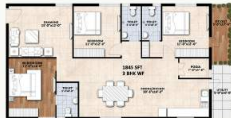
FLAT 2 & 3 CARPET AREA 1288.32 SFT BALCONY AREA 88.05 SFT COMMON AREA 468.63 SFT SUPER BUILT AREA 1845 SFT