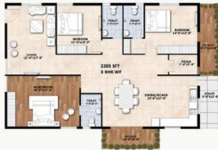
FLAT 4 CARPET AREA 1496.07 SFT BALCONY AREA 167.49 SFT COMMON AREA 541.44 SFT SUPER BUILT AREA 2205 SFT