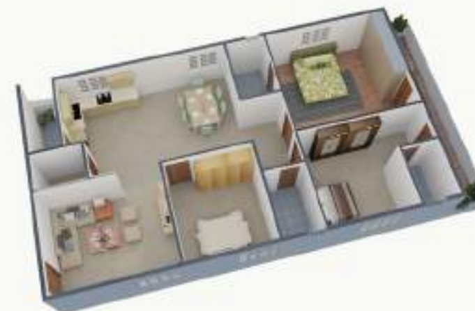
3 BHK RESIDENCES