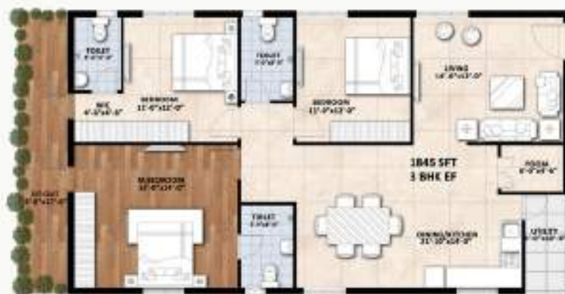
FLAT 16 CARPET AREA 1240.22 SFT BALCONY AREA 137.67 SFT COMMON AREA 467.11 SFT SUPER BUILT AREA 1845 SFT