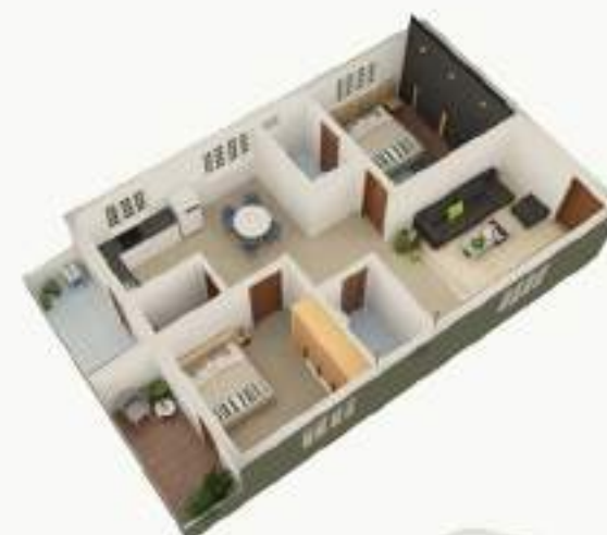
2 BHK RESIDENCES