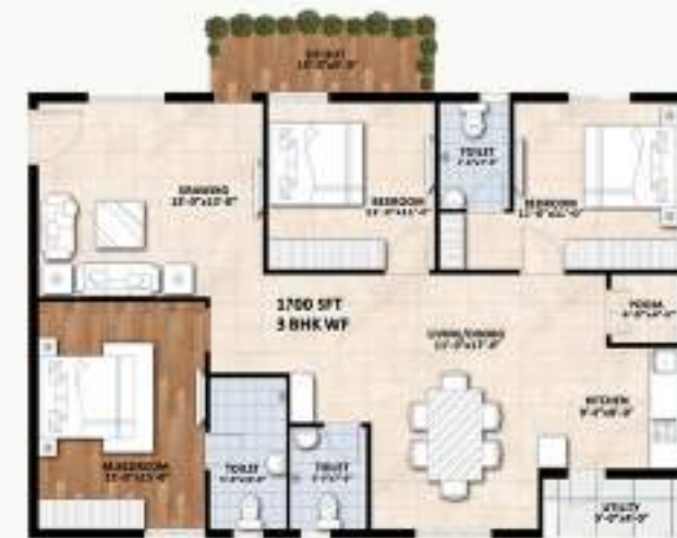
FLAT 8 CARPET AREA 1192.96 SFT BALCONY AREA 75.99 SFT COMMON AREA 431.05 SFT SUPER BUILT AREA 1700 SFT