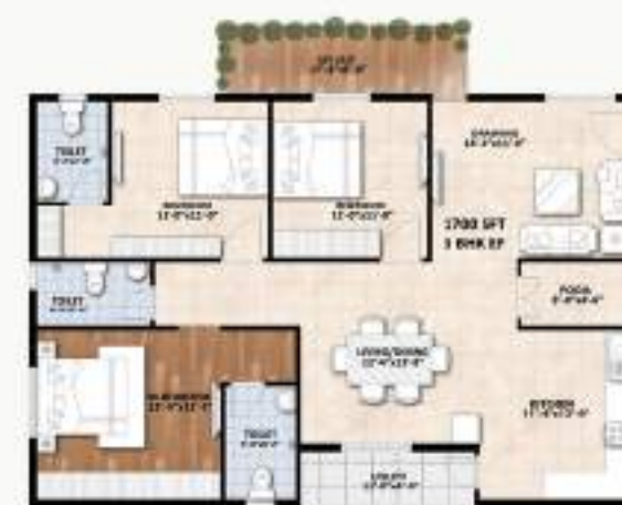
FLAT 10 CARPET AREA 1187.47 SFT BALCONY AREA 76.10 SFT COMMON AREA 436.43 SFT SUPER BUILT AREA 1700 SFT