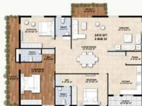
FLAT 15 CARPET AREA 1616.19 SFT BALCONY AREA 249.18 SFT COMMON AREA 604.63 SFT SUPER BUILT AREA 2470 SFT