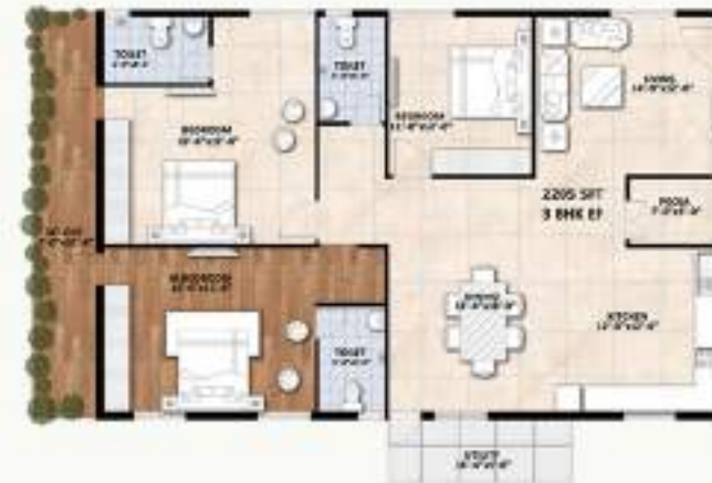
FLAT 18 CARPET AREA 1501.03 SFT BALCONY AREA 157.69 SFT COMMON AREA 546.28 SFT SUPER BUILT AREA 2205 SFT