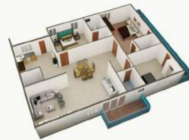
3 BHK RESIDENCES