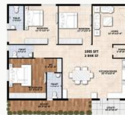
FLAT 11 & 12 CARPET AREA 1353.45 SFT BALCONY AREA 143.80 SFT COMMON AREA 497.75 SFT SUPER BUILT AREA 1995 SFT