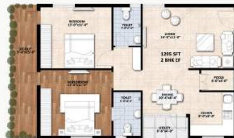
FLAT 5 & 6 CARPET AREA 829.36 SFT BALCONY AREA 124.21 SFT COMMON AREA 341.43 SFT SUPER BUILT AREA 1295 SFT