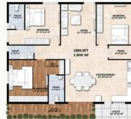
FLAT 7 & 9 CARPET AREA 1353.45 SFT BALCONY AREA 143.80 SFT COMMON AREA 497.75 SFT SUPER BUILT AREA 1995 SFT