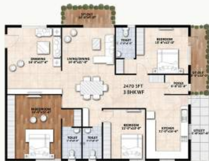
FLAT 1 CARPET AREA 1703.49 SFT BALCONY AREA 163.71 SFT COMMON AREA 602.8 SFT SUPER BUILT AREA 2470 SFT